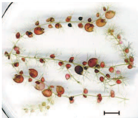
Figure 1: Utricularia reflexa (a clone noted as having relatively large traps) from Zambia grown under nearly-natural conditions in outdoor aquaria. Scale bar indicates 10 mm; the largest trap size is 7 mm; September 2007.

It should be noted that the in vitro Utricularia species looked quite different than the plants from the nearly-natural cultures. The former group of plants had relatively abundant but small traps the maximum size of which did not extend 1.5 mm (or 2.5 mm in U. reflexa ; see Figure 1), while the latter plant group had much larger traps (usually 2-4 mm, but up to 7 mm in U. reflexa ; see Figure 2). It is possible to assume that the proportion of trap biomass to the total plant biomass ( i.e. , investment in carnivory) is much lower in grown aquatic species than in the same